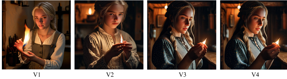
Fig. 2. Example of image variations generated by applying different prompt optimization techniques.

Fig. 2 shows the images generated for the aforementioned scene description by applying the previously described prompt optimization techniques: V1 is the image based only on the original scene description; V2 combines the original scene description with the default illustration style; V3 combines the original scene description, the default illustration style, and the general negative prompt; and V4 combines all prompt optimization techniques used in V3 with the scene description that uses parentheses to increase the emphasis of certain elements.